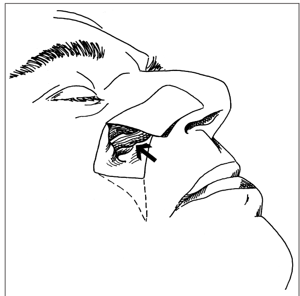
Figure 7. The arrow indicates the myocutaneous pedicle that has been raised and dissected to allow inferior rotation.

One patient with a Burget flap developed a significant complication, becoming erythematous and swollen in the first week. Oral antibiotic therapy was initiated. Superficial tip necrosis developed, and division was delayed for 6 weeks. Despite this setback, the result at 1 year was satisfactory. The complication occurred in a patient who smoked approximately 50 cigarettes a day.